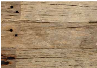
HARDWOOD SLEEPERS GREY FACED