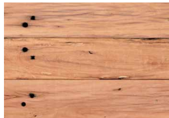
HARDWOOD SLEEPERS DRESSED ALL ROUND