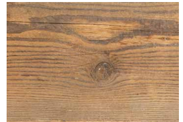
OREGON GREY FACED