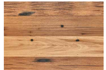
HARDWOOD BRIDGE TIMBERS DRESSED ALL ROUND