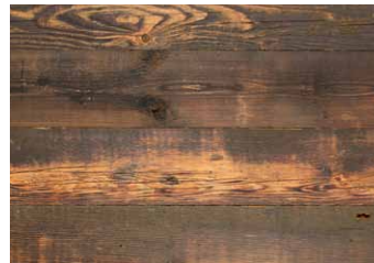
OREGON SKIP DRESSED