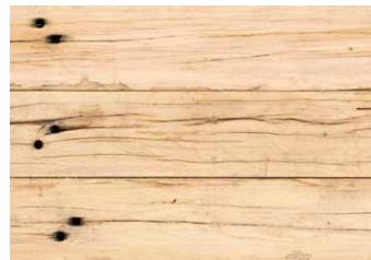
HARDWOOD SLEEPERS DRESSED ALL ROUND