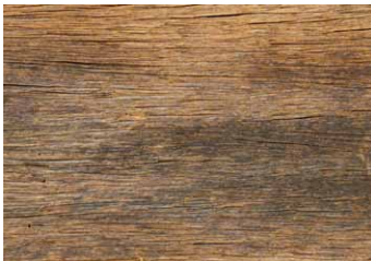
HARDWOOD GREY WIRE BRUSHED